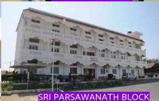
SRI PARSAWANATH BLOCK