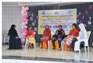
INTER DEPARTMENT COMPETITION COMMERCE AND COMMERCE CA