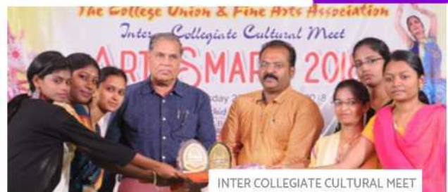
INTER COLLEGIATE CULTURAL MEET