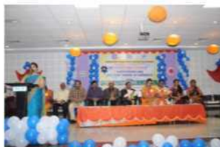
INTERNATIONAL SEMINAR DEPARTMENT OF COMMERCE