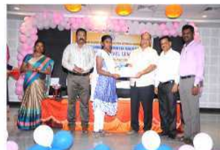
NATIONAL LEVEL SEMINAR DEPARTMENT OF MATHEMATICS