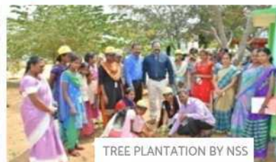
TREE PLANTATION BY NSS