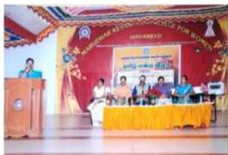
TAMIL MANDRAM DEPARTMENT OF TAMIL