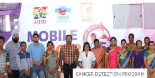
CANCER DETECTION PROGRAM