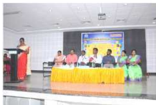
SEMINAR, DEPARTMENT OF COMPUTER SCIENCE AND COMPUTER APPLICATION