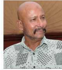
Mr. N. H. SYED KIRMANI Former Indian Cricketer