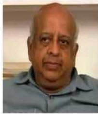
Mr. T. N. SESHAN, IAS Former Chief Election Commissioner