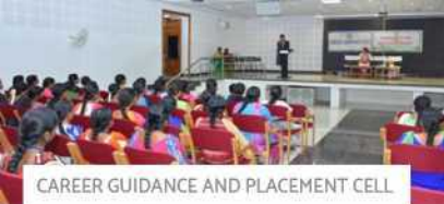
CAREER GUIDANCE AND PLACEMENT CELL