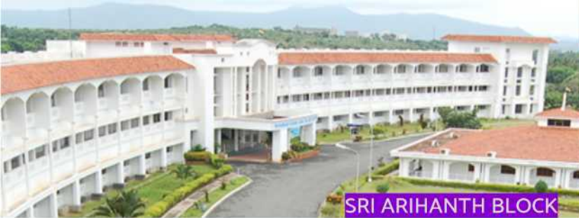
SRI ARIHANTH BLOCK