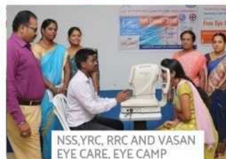
NSS, YRC, RRC AND VASAN EYE CARE, EYE CAMP