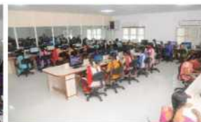
COMPUTER SCIENCE LAB