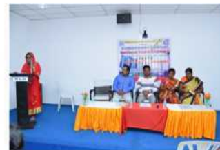
WORKSHOP PG AND RESEARCH DEPARTMENT OF BIO CHEMISTRY