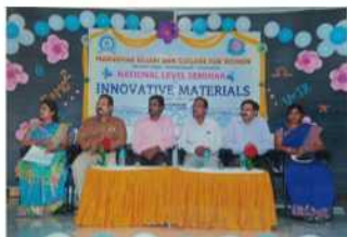
NATIONAL LEVEL SEMINAR DEPARTMENT OF PHYSICS