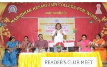
READER'S CLUB MEET