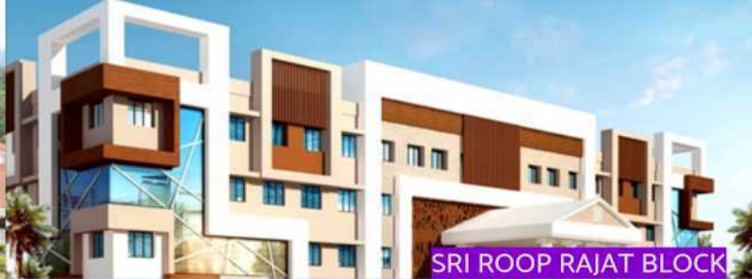
SRI ROOP RAJAT BLOCK