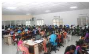
COMPUTER APPLICATION LAB