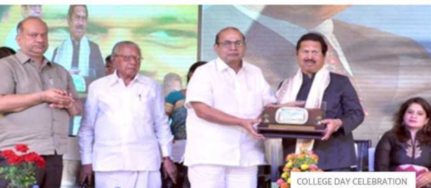
COLLEGE DAY CELEBRATION