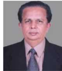
Dr. MADHAVAN NAIR Former Chairman ISRO