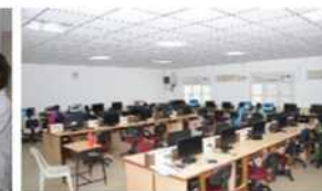
ENGLISH LANGUAGE LAB