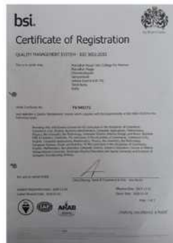
ISO 9001:2015 CERTIFICATE