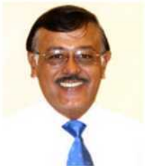
Mr. S. VENKATARAGHAVAN Renowned Cricketer