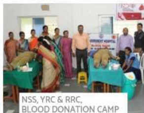
NSS, YRC & RRC, BLOOD DONATION CAMP