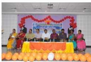
NATIONAL CONFERENCE DEPARTMENT OF BIO-TECHNOLOGY