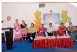
CHEM BLAST 2K18 DEPARTMENT OF CHEMISTRY