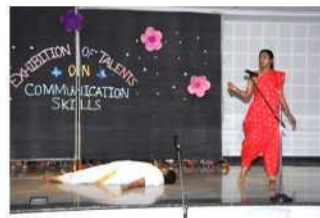
EXHIBITION OF TALENTS ON COMMUNICATION SKILL DEPARTMENT OF ENGLISH