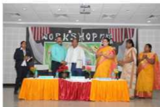
WORKSHOP DEPARTMENT OF BUSINESS ADMINISTRATION