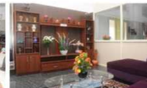
INTERIOR DESIGN AND DECOR LAB