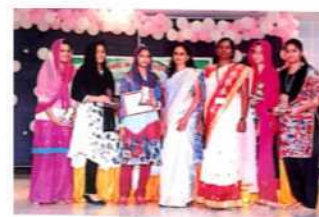
WORKSHOP DEPARTMENT OF INTERIOR DESIGN AND DÉCOR