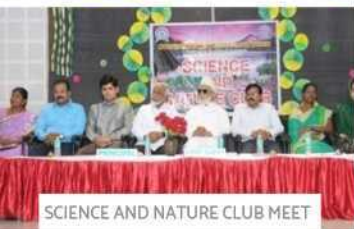
SCIENCE AND NATURE CLUB MEET