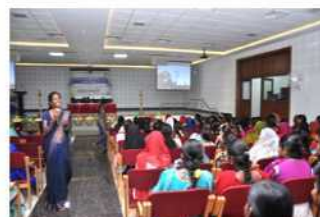
CELEBRATION OF NATIONAL NUTRITION WEEK DEPARTMENT OF NUTRITION