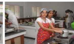
FOODS & NUTRITION LAB