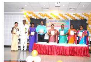
NATIONAL CONFERENCE DEPARTMENT OF ENGLISH