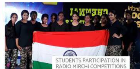
STUDENTS PARTICIPATION IN RADIO MIRCHI COMPETITIONS