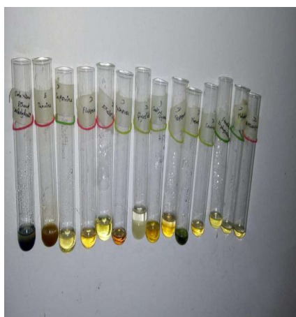
Figure 1: The preliminary phytochemical investigation shows the presence of phytoconstituent such as the saponins, flavonoids, alkaloids, phenols was subjected to qualitative analytical test are present plant extract.

Phytochemical screening of crude hexane, ethylacetate and ethanol extracts from S. rhombifolia leaf samples disclosed the existence of certain secondary metabolites such as tannins, saponins, carbohydrates, alkaloids, quinones, flavonoids, glycosides, terpenoids, heart glycosides phenols, coumarins, phytosteroid, anthraquinones, phlobutanins, as shown in Table 1. Sida rhombifolia (L.) leaves have been subjected to the plant's qualitative analytical test. Flavonoids, steroids, glycosides and alkaloids have been detected to be the most effective principles in plant. These phytoconstituents can be liable for many the pharmacological activities such as antidiabetic, cholesterol lowering and wound healing.