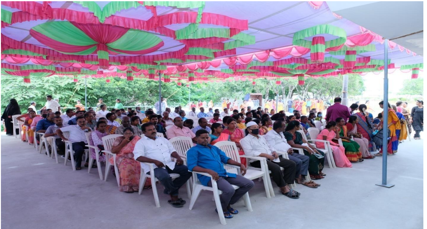
PRINCIPAL Marudhar Kesari Jain College for Women Vaniyambadi - 635 751